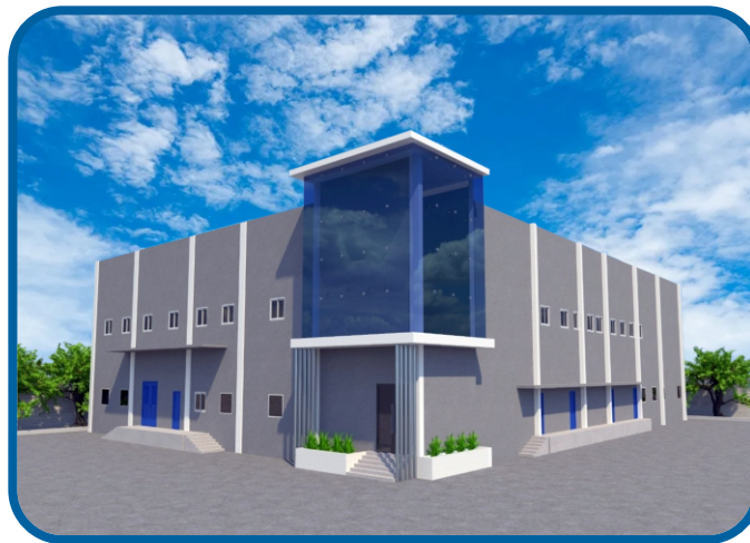
Unit-2 Oncology Injections