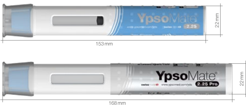
YpsoMate 2.25 and YpsoMate 2.25 Pro with 8 mm needle configuration