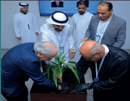
A Symbol of Growth and Prosperity Inauguration of CPA, Planted by President, CEO & GM