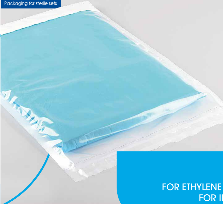
Packaging for sterile sets