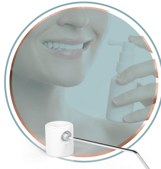
Actuators for 20 mm valves and pumps