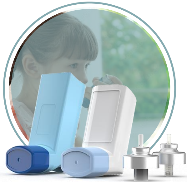
pMDI valves and actuators

Packaging components, filling machines and connected devices