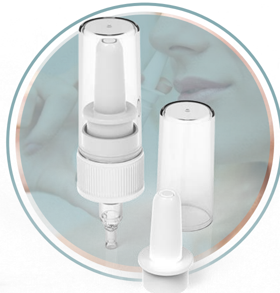
Spray pumps and actuators