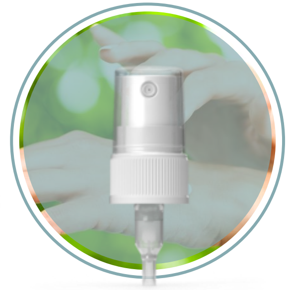
Actuators for specific applications