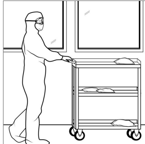
Pass through lower classed areas.