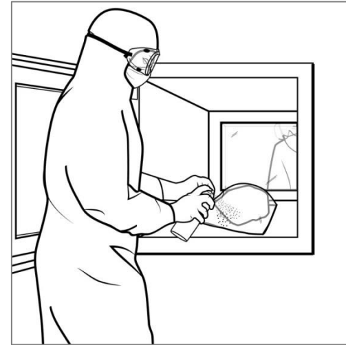
Surface sanitize before passing through to ISO5 area.