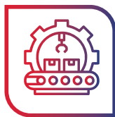
Contract Research and Mfg. Service