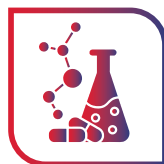
Formulation & Development of Novel Drugs Delivery System (N.D.D.S.)