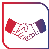
Technical Collaboration and Joint Venture