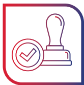
New Formulation with DCGI Approvals.

DEN MARK PHARMACEUTICALS PVT. LTD. specialises in developing new formulations, undertaking bio equivalence studies clinical trials, obtaining the approval from the Drug Controller General of India (DCGI) for manufacturing and marketing new Fixed Dossage Combinations (FDCs) and molecules & Latest Technology driven products.