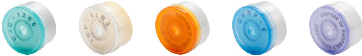
Aluminum Printed Seals