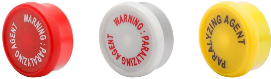
Flip Printed Seals