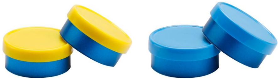
Aluminum and Plastic color combinations