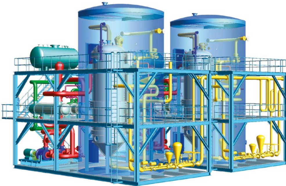
Phosgene Generator: Capacity 2 x 12,500 kg/h, Hungary