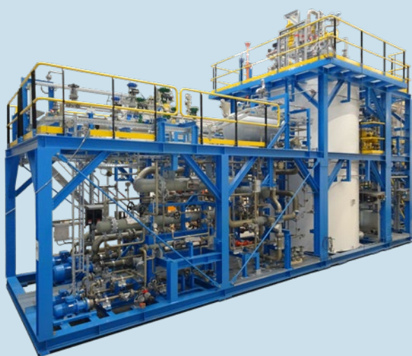
Phosgene Generator: Capacity 2,000 kg/h, India

Phosgene is a very versatile raw material commonly used in the production of many organic compounds. Reactions using phosgene produce high purity products with high yields. However, phosgene's reactivity and toxicity make it a particular hazard and as such, regulatory authorities impose stringent safeguards on its storage, transportation and use. Alternative reagents, like thionylchloride or phosphorylchloride, however, pose even greater risks.