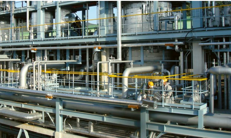
30,000 mtpy Ethoxylation Plant, South Korea