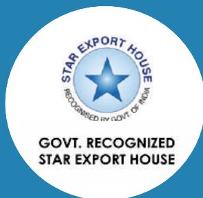
One Star Export House

HTMC continues to embark on new journey with sheer dedication and passion to excel. In addition to providing innovative, high quality products and services to our clients, the company has obtained the following certifications which assures that the very best will reach out to its customers.