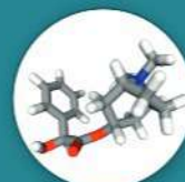
Intermediates &amp; Impurities