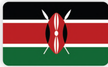
PPB – Kenya