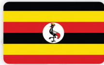
NDA – Uganda