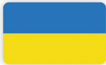
PIC/s – Ukraine