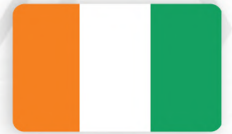
DPML - Ivory Coast