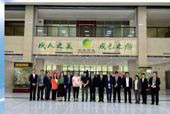
2023 PAI Inspection by US FDA