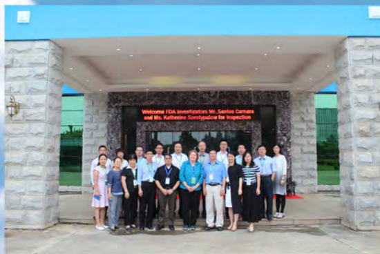
2017 PAI Inspection by US FDA