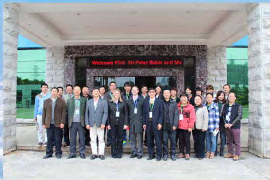
2016 Unannounced Inspection by US FDA