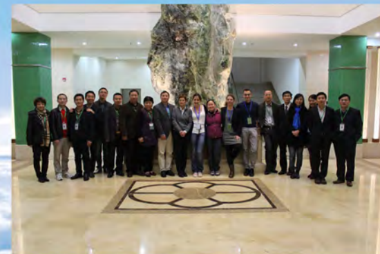
2016 PAI Inspection by AIFA