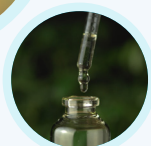
Oral Solutions Fast Acting