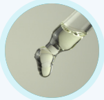
Oral Solutions Mint

Oral drops formula based on purified full spectrum cannabis extract that combines a wide variety of THC/CBD ratios, genetics and formulations with different flavor options to cover a wide range of medical conditions while improving the patient experience and compliance.