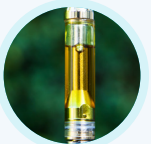
Inhalation Extracts Essentials