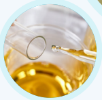
Oral Solutions Essentials