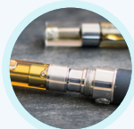
Inhalation Extracts Origins