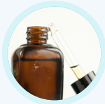
Oral Solutions Origins

Oral drops formula based on purified full spectrum cannabis extract that combines a wide variety of THC/CBD ratios, genetics and formulations with different flavor options to cover a wide range of medical conditions while improving the patient experience and compliance.