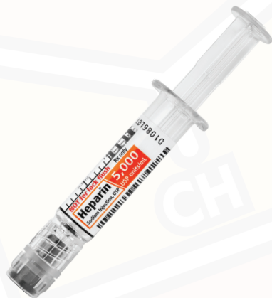
PFS (Pre-filled Syringe)