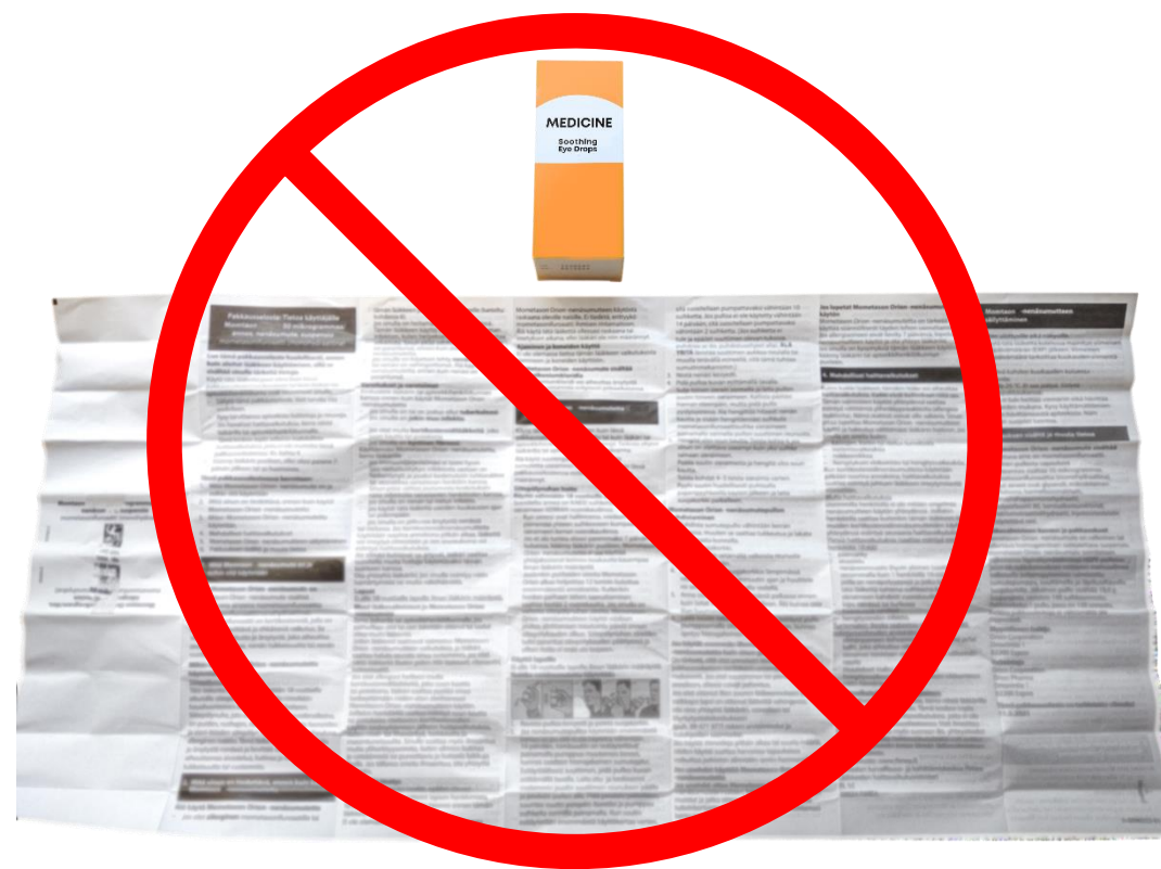
The standard leaflet for pharmaceuticals