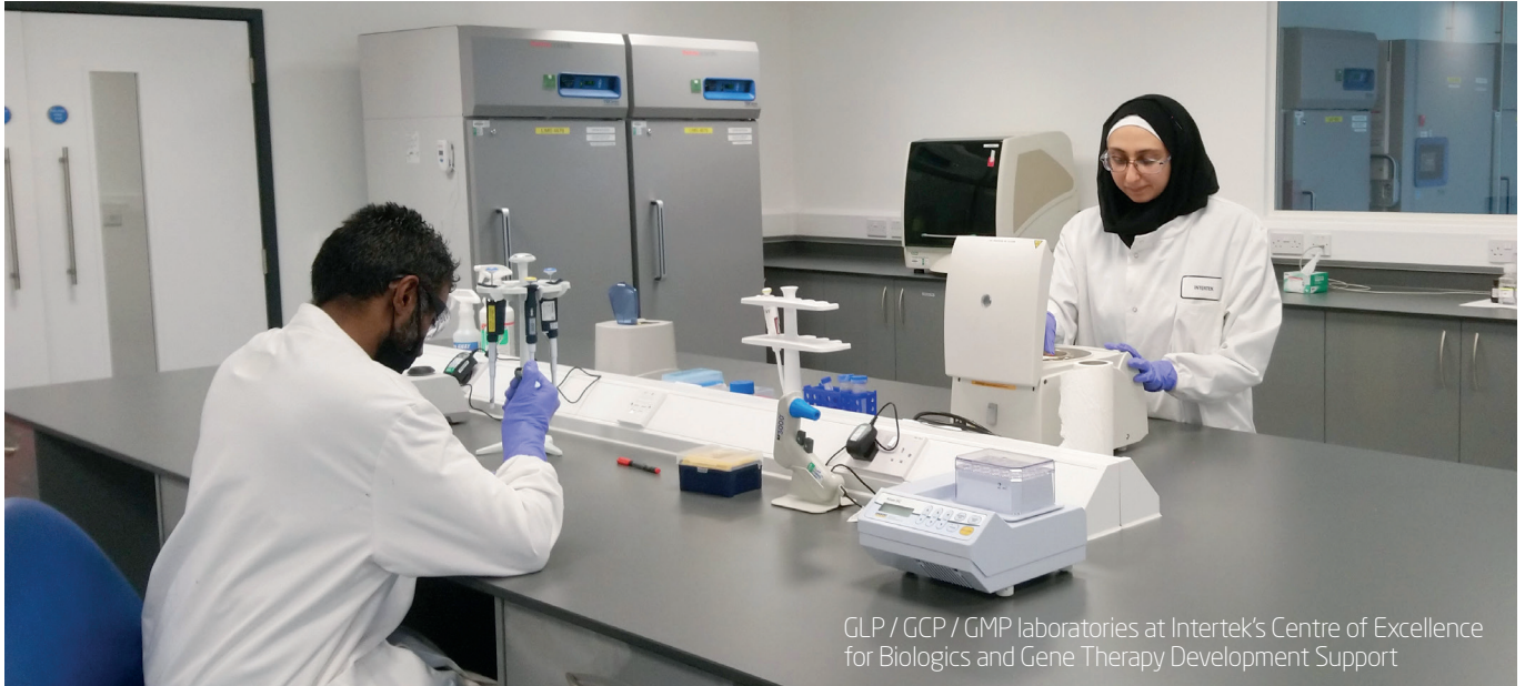
GLP / GCP / GMP laboratories at Intertek's Centre of Excellence for Biologics and Gene Therapy Development Support