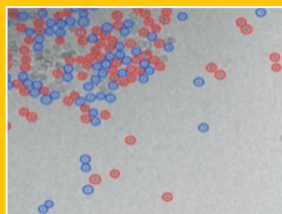
Figure 2: Cryo-TEM Image analysis of filled (red) and empty (blue) capsids allowing for statistical evaluation

Cryo-TEM can accurately discriminate and quantify particles containing partial genomes from full/empty particles and is now routinely used to characterize the composition of AAV vector preparations. Cryo-TEM can clearly visualize viral vectors in their native state and distinguish between full and empty capsids allowing for accurate statistical analysis (Figure 2).