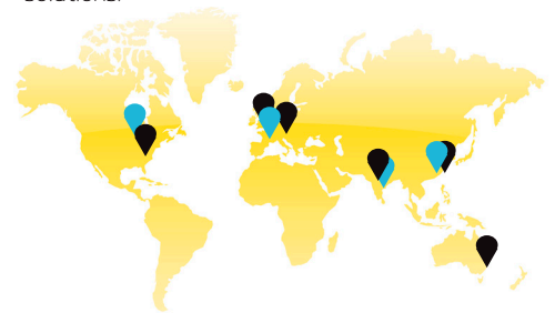
📍 Laboratory Services 📍 Assurance Solutions

You can rely on our global network of experts, laboratories and specialists to deliver support including analysis, bioanalysis, formulation development, biologics characterization, specialist inhalation development expertise, regulatory consultancy, risk assessment, auditing and supply chain management solutions.