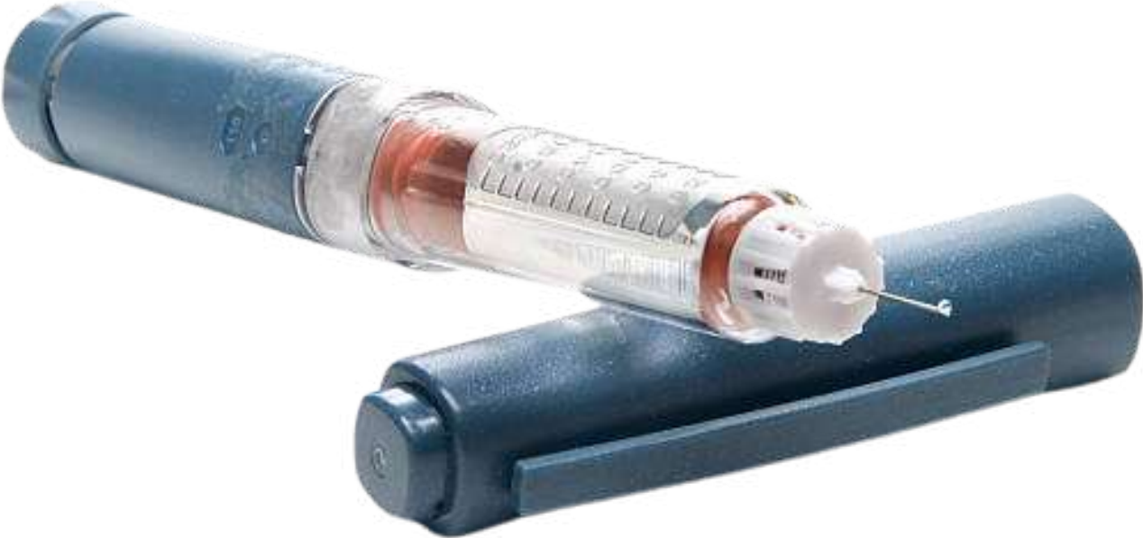
Diabetes Delivery Device