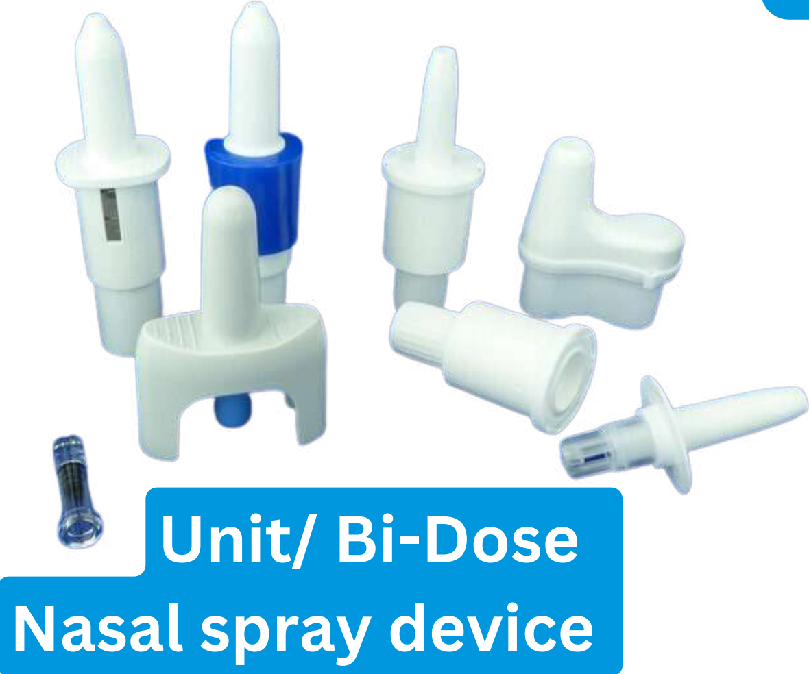
Unit/ Bi-Dose Nasal spray device