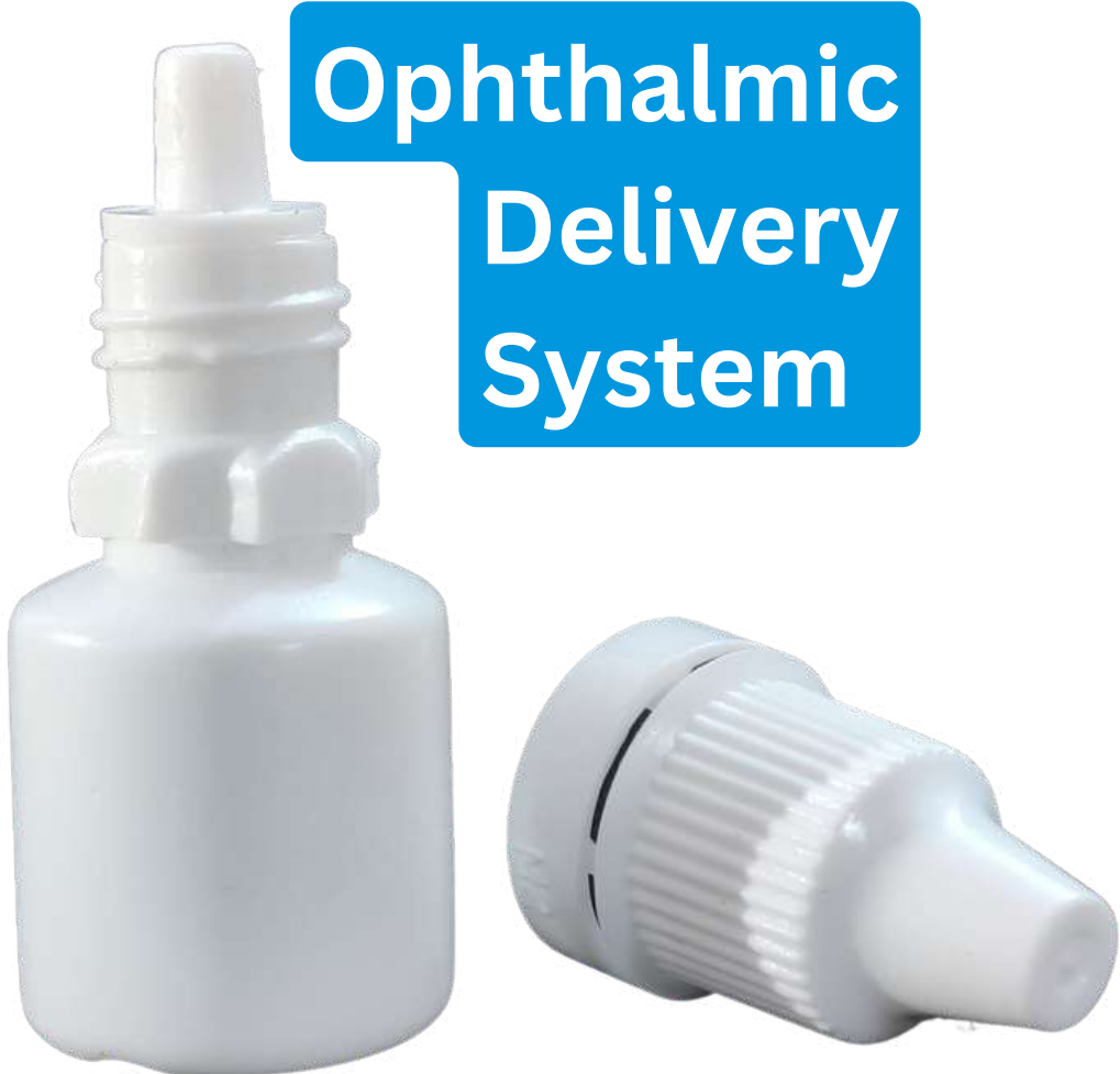
Ophthalmic Delivery System