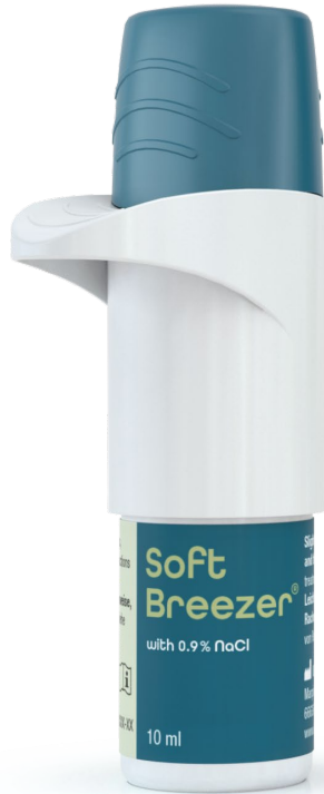
Inhaler for gentle breathing