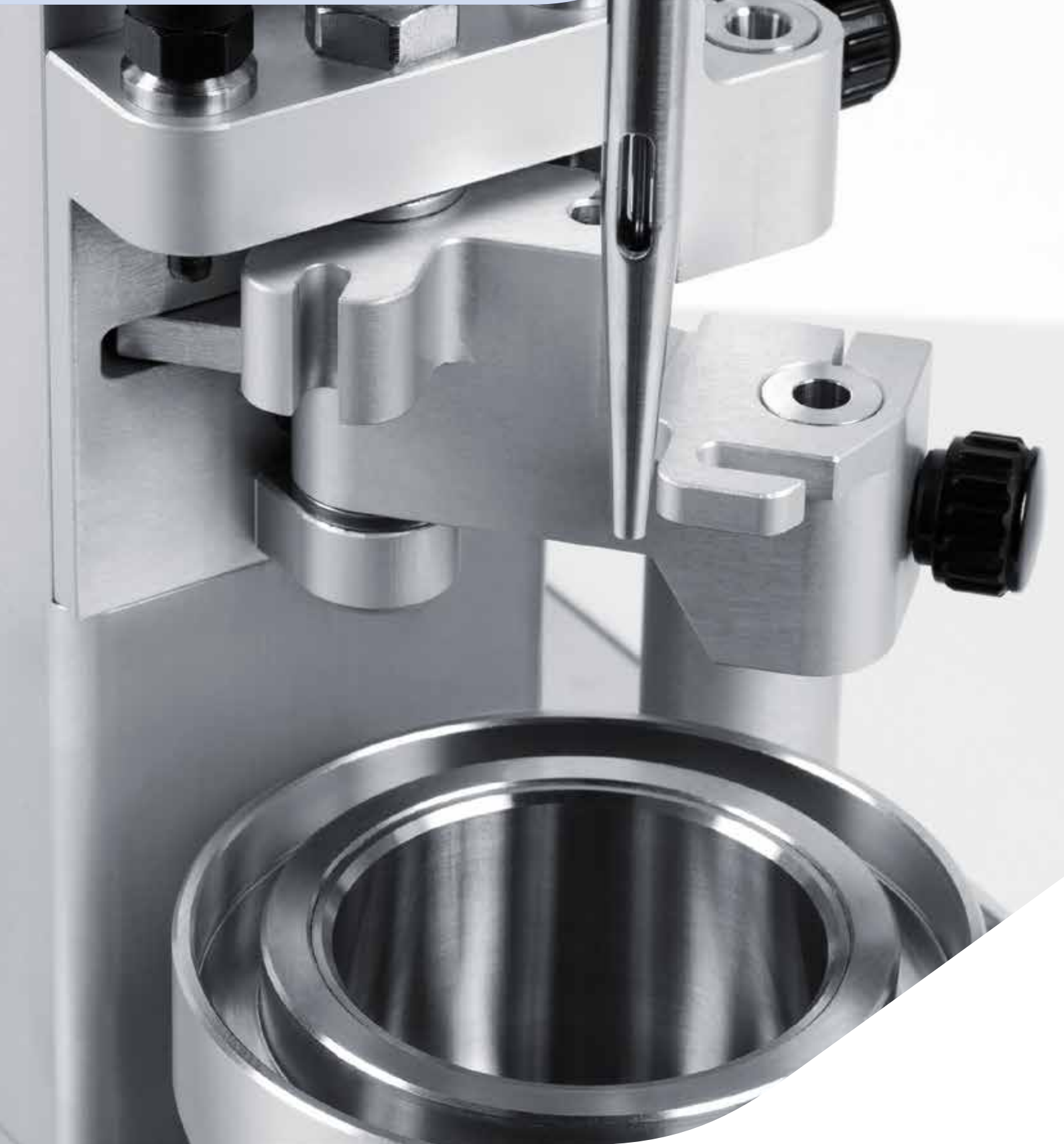
TABLE-TOP DEVICE FOR CAPSULE FILLING