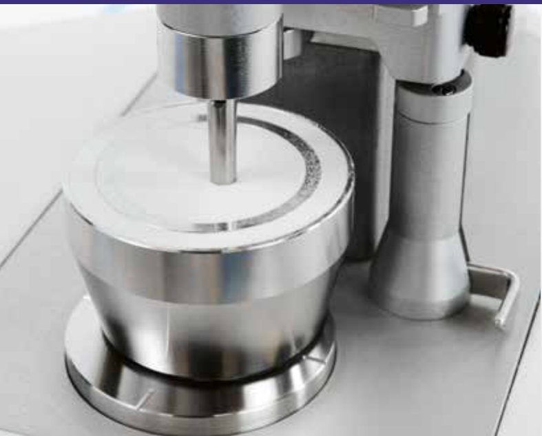
Powder bowl and dosator