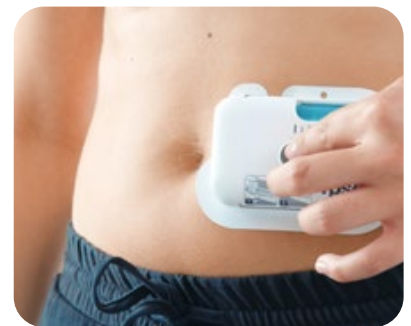
2-step patch and inject