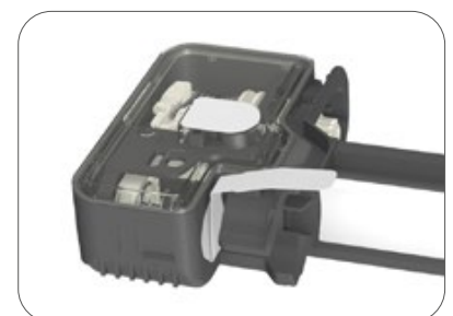
Needle Unit with built-in sterility