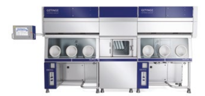
Two 3-glove UDAF ISOFLEX-R with hatch in the middle