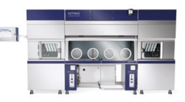
\hbox{4-glove UDAF ISOFLEX-R with two hatches}\\