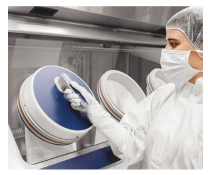
Wireless Glove Leak Tester (GLT)