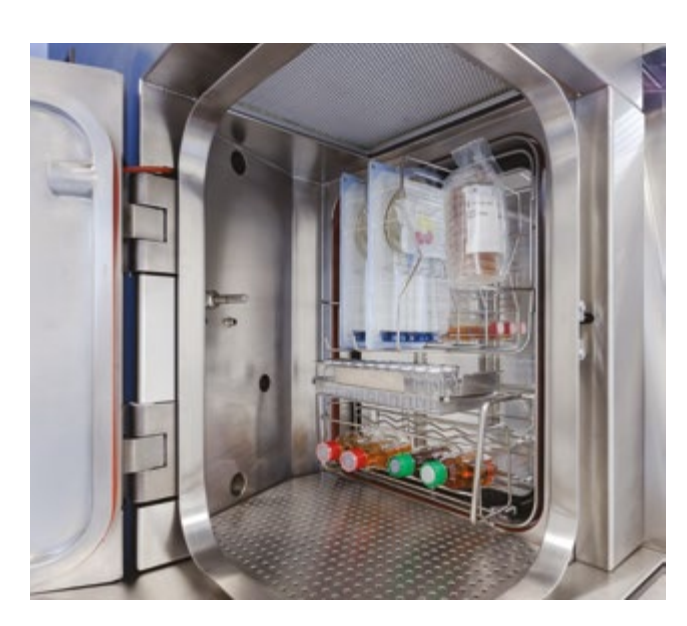
Isoturn hatch before decontamination

The optional ISOTURN transfer hatch provides fast bio-decontamination. A space-saving rotating door makes it possible to unload while reloading/bio-decontaminating another load.