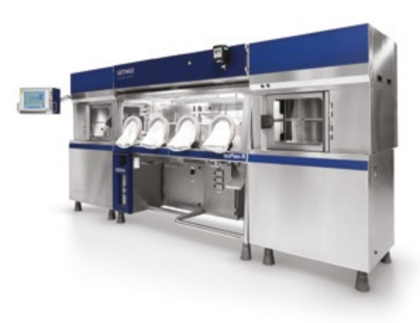
4-glove ETF ISOFLEX-R with two hatches