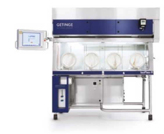
4-glove ETF ISOFLEX-R