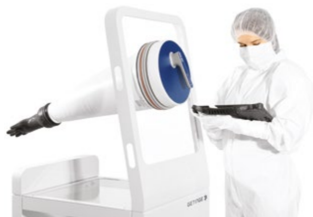
Glove Leak Tester (GLT) shown on demo display

Ensure a safe production and process control with the paperless Glove Leak Tester that enables seamless in-situ glove testing. Wireless, paperless and pipeless, the GLT allows for accurate and repeatable testing for glove and sleeve integrity, i.e. detecting perforations not visible to the naked eye.