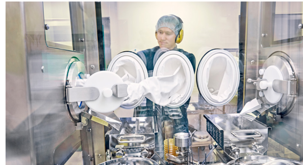
DPTe® Transfer systems

Today's drugs contain a significant proportion of active pharmaceutical ingredients (API) and highly potent active pharmaceutical ingredients (HPAPI). During the formulation and production of drug products, operators must be protected from these substances. Getinge's isolation technology and washing systems protect your personnel and the environment, and help ensure safe handling of active ingredients.